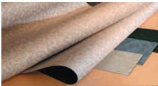
Elegant Fabric Overlays