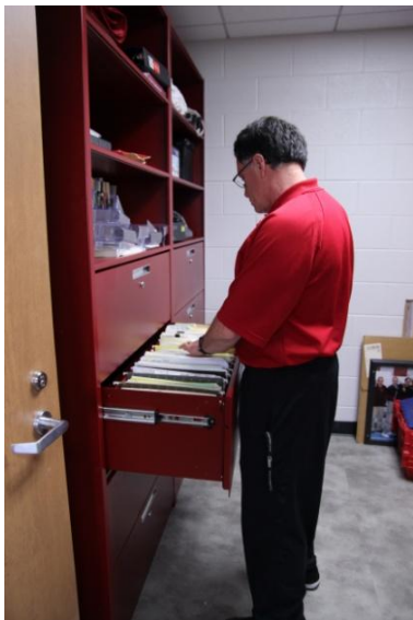
Waubonsee Community College, Athletic Department Storage for files, office supplies, coffee service and cleaning on Aurora Shelving (Left)