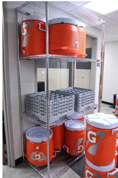
Concession Stand prep area with sports drink coolers on Aurora Wire Shelving (Right)