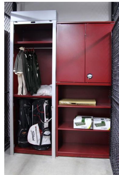
Tennis (top image) and golf team storage (bottom image)