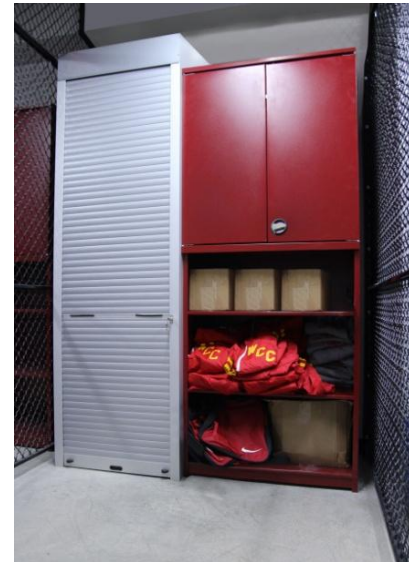
Aurora Shelving features locking cabinets and shelving in caged area where expensive personal equipment can be secured

A large portion of the field house has areas of caged storage for golf and tennis equipment. Each storage section is outfitted with a combination of Aurora Shelving components: 1) Open shelving for gear bags, towels, and buckets of tennis and golf balls. 2) Tall Shelving with locking tambour doors to safely keep expensive equipment such as tennis rackets and golf clubs. This shelving is divided in two sections with a garment rod above to store uniforms or street clothes. 3) A locking cabinet above the open shelving for miscellaneous secured storage.