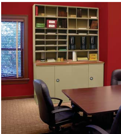
Quik-Doors shown on shelving.

* Additional Charges Apply. Consult your Dealer Representative.