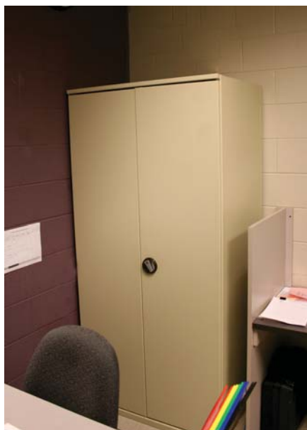
Quik-Doors shown on shelving with optional Wardrobe Kit.