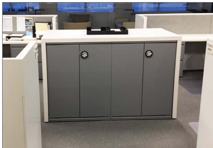
Quik-Door Cabinets with a Counter Top