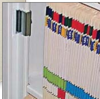
Optional extension kit for end tab filing adds 1 1/2" to shelving depth.